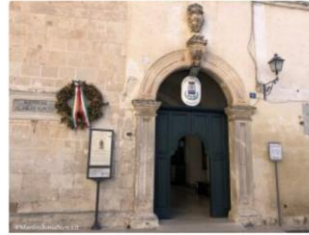
"Il Consiglio dei Ministri, su proposta del Ministro dell'interno Luciana Lamorgese, a seguito di accertati

now more than 5 associations recruiting volunteers throughout town. It took so little to show people that a difference can be made if one works on change and does not give up on hope.