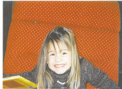
A happy passenger on her way to Florida!

So while we were praying and fasting the Lord prepared some of the leaders' hearts and miraculously revealed a path that is infinitely better than what we could have planned. We are now feeling extremely blessed to be guests of a saint, trained by seasoned staff in the specific ministry, and surrounded by a beautiful environment. Thus, the willingness to let go (that means 100% not 80 or 90%) and let God become an issue of fundamental trust. He does not need our input to bring His plan to completion, however He needs our total, unwavering obedience primarily to bless us in the process. Where do you stand? This year let us make an effort to move away from being nominal Christians by letting the Potter squeeze, cut chisel without our grumbling.